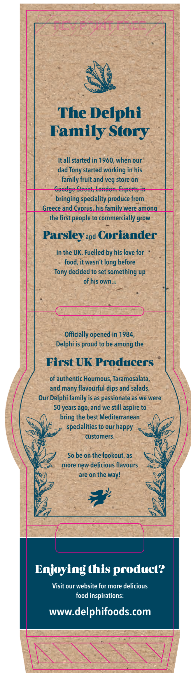
Inline Matt Varnish