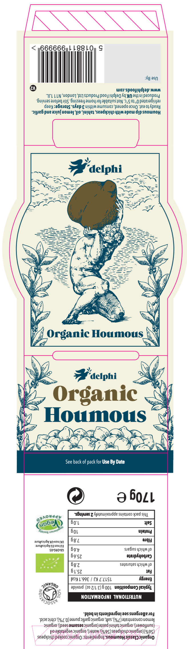
Process + Pan 8642 (Gold)