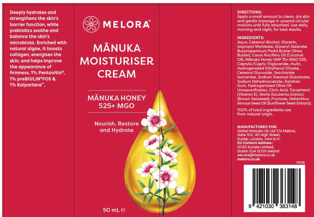
[Secondary Packaging - Carton AW – Not to scale]