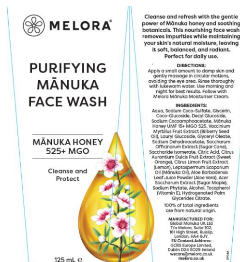
[Primary Packaging - Label AW – Not to scale]

CONFIDENTIAL – INTERNAL USE ONLY – ALL RIGHTS RESERVED.