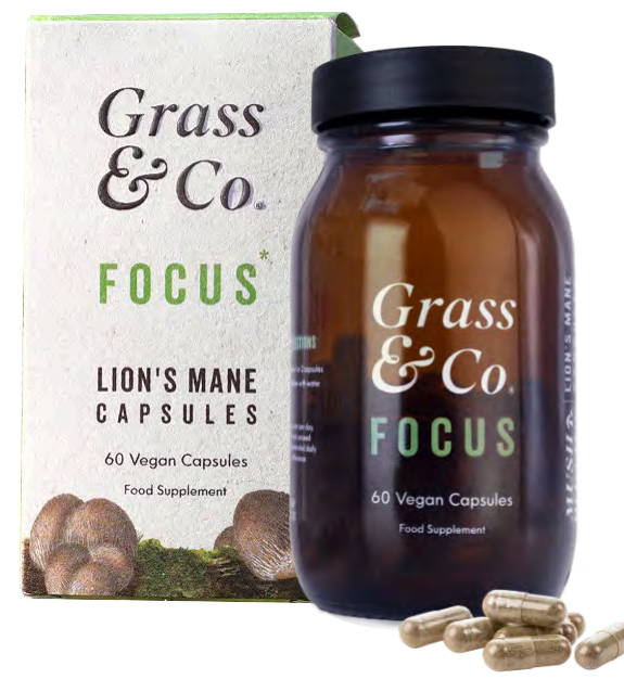
FOCUS (BRAIN FUNCTION)