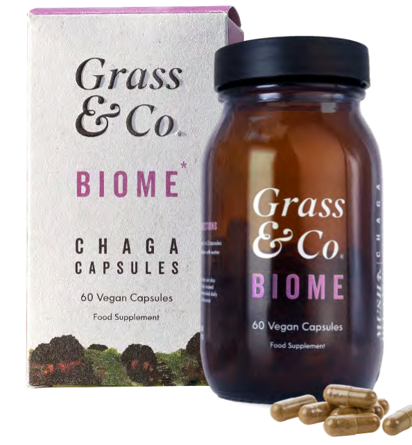
BIOME (GUT HEALTH)