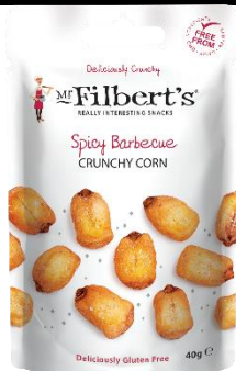
Front Of Pack